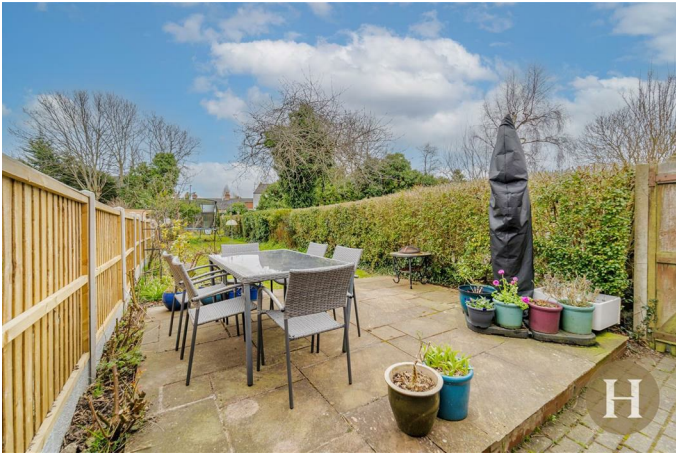
Slabbed patio area, large lawn, a mixture of fence and hedge boundaries and side gate.